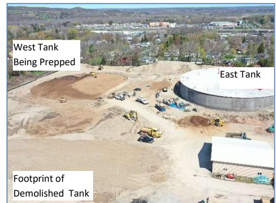
ACTUAL LAYOUT OF FAIRMOUNT TANKS

Questions or concerns on this project can be addressed to OCWA contact Deb Owens at 315-455-7061 x 3131, or dowens@ocwa.org , or at the address above.