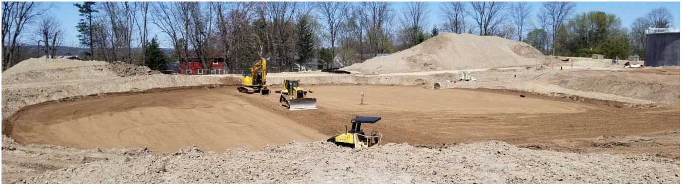
Preparation is ongoing for the West Tank foundation and floor.