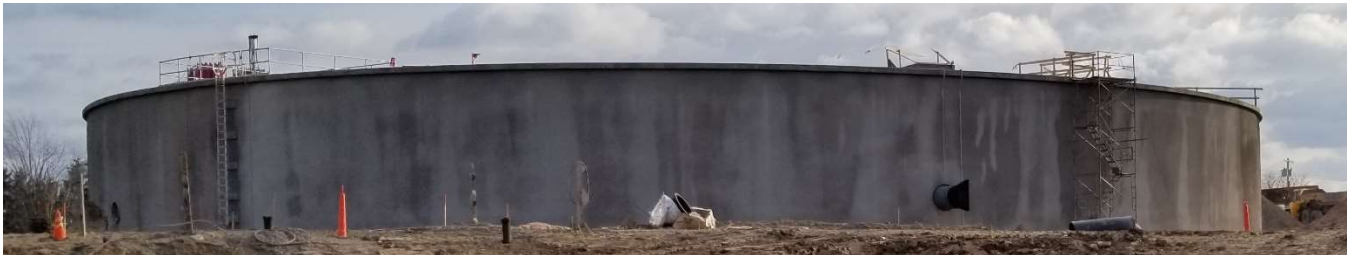
New East Tank in Operation – 6 Million Gallons

Work has now moved towards the West Tank and involves a significant amount of preparation for the foundation. The site contractor has been moving soil and stone to prepare for the floor of the second tank and for final grading of those areas where work has been completed. The floor of the West Tank was cast on June 25 th marking a major progress milestone.