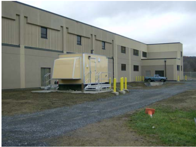
Figure 1. OCWA's water treatment plant in the town of Marcellus, New York, has undergone infrastructure improvements designed to enhance its overall performance.

Water first enters the Rapid Mix tank where a coagulant (polyaluminum chloride) and a taste and odor control chemical (powdered activated carbon) are added. After 30 seconds of mixing, the water enters the Contact Basins where calm conditions allow the coagulant to make small particles adhere together to form larger particles. Some of these particles settle and are cleaned out later. The contact time in the basins also allows the powdered activated carbon (used during times of high algae growth in the lake) to absorb organic taste and odor causing chemicals.