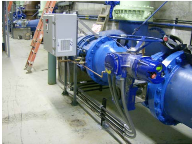
Figure 5. As part of the improvements, automated valves were installed and connected to the instrumentation network.

After considering alternative vendor offerings, OCWA's project team decided upon the NET Concentrator System (NCS) from Moore Industries. This smart I/O system takes advantage of "cable-concentrating" technology, which eliminates point-to-point cable, conduit and wire trays by sending process monitoring and control signals between the field and control room on a single digital communication link. The system provides true signal isolation, with isolated modules for both analog and digital I/O. All discrete and analog signals are digitized, packetized and communicated via Ethernet communications using standard Ethernet cables, LAN switches and routine Ethernet hardware (See Fig. 6).