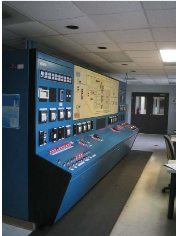
Figure 3. Original analog control system at Otisco Lake Water Treatment Plant, Onondaga County Water Authority.

In the water purification process, controllers turn pumps off and on, open and close valves and send operating conditions—temperature, electricity, flow, level and other relevant data—to the main control room. Visibility of this information through the Human-Machine Interface (HMI) is essential since it allows operators to monitor and track all critical parameters.