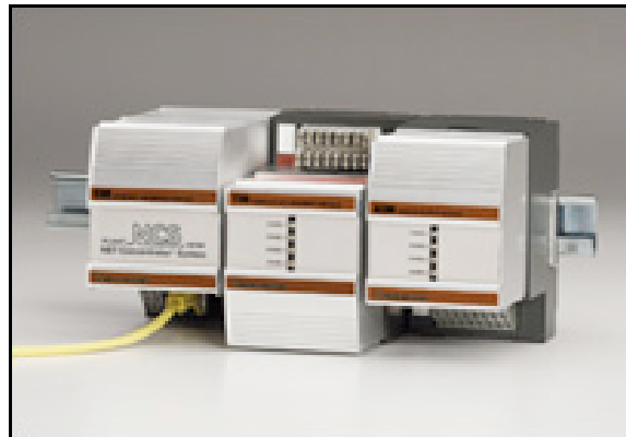
Figure 6. Moore Industries' NET Concentrator System (NCS) provides a solution for Distributed I/O and Remote I/O.

After considering alternative vendor offerings, OCWA's project team decided upon the NET Concentrator System (NCS) from Moore Industries. This smart I/O system takes advantage of "cable-concentrating" technology, which eliminates point-to-point cable, conduit and wire trays by sending process monitoring and control signals between the field and control room on a single digital communication link. The system provides true signal isolation, with isolated modules for both analog and digital I/O. All discrete and analog signals are digitized, packetized and communicated via Ethernet communications using standard Ethernet cables, LAN switches and routine Ethernet hardware (See Fig. 6).