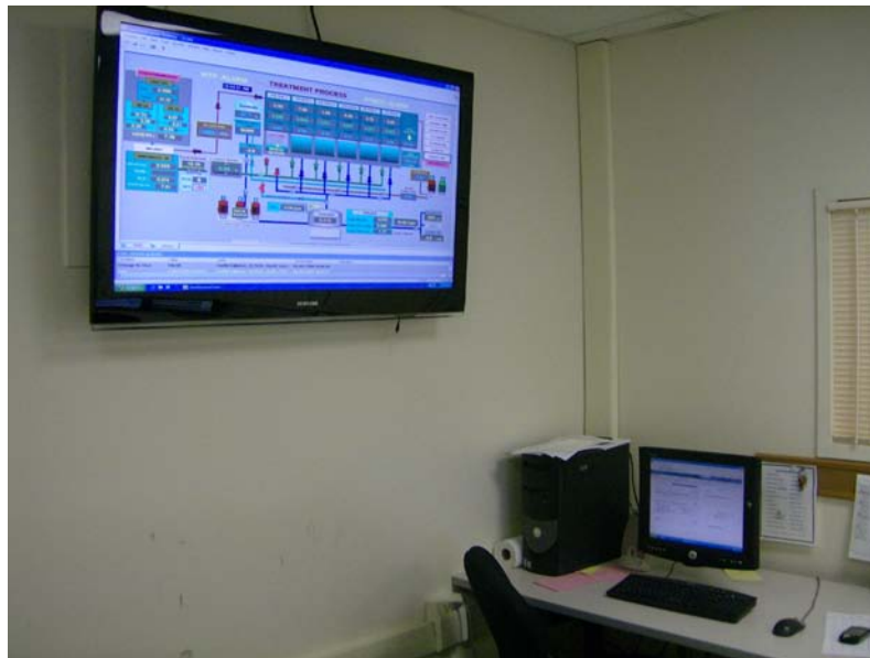
Figure 4. Process functions are now controlled through a PC/PLC-based control system.

In October 2008, the Marcellus facility began the task of replacing outdated analog control equipment with the latest technology, and moving all process automation functions to an online SCADA system (See Fig. 4). The project called for replacing existing RTUs to provide a scalable platform suitable for a variety of small applications, as well as control strategies spanning the entire plant; and gaining the ability to leverage modern digital signal transmission.